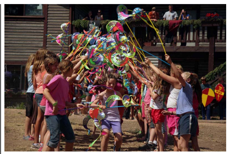
Four cabins of girls twirled about the meadow with "whirly-gigs" to entertain Royalty during the KHII Pageant.