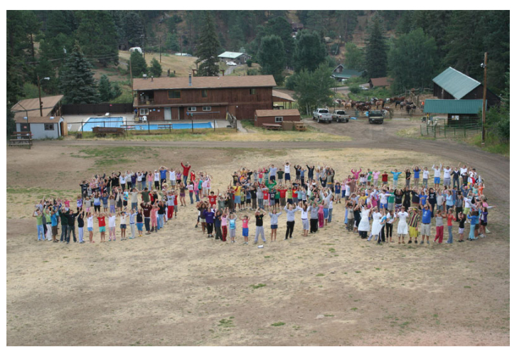
The opening day of the Beijing Summer Olympics was celebrated at the Glen with an "8-8-8" gala! August 8, 2008, 8-8-8, commemorating this once-in-a-lifetime event, everyone gathered in the meadow to celebrate the number eight!