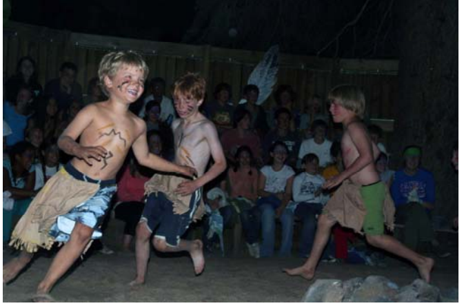
Junior boys stalk "Big-Foot Sasquatch" during the American Heritage Pow Wow

Watch for the raffle drawing with your registration materials coming soon!